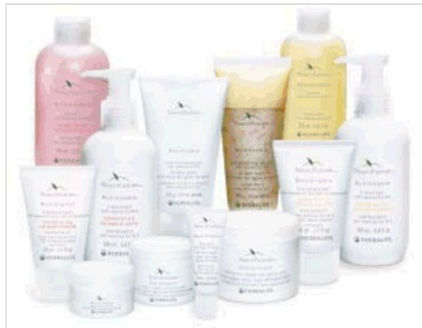
skin & hair care outer nutrition