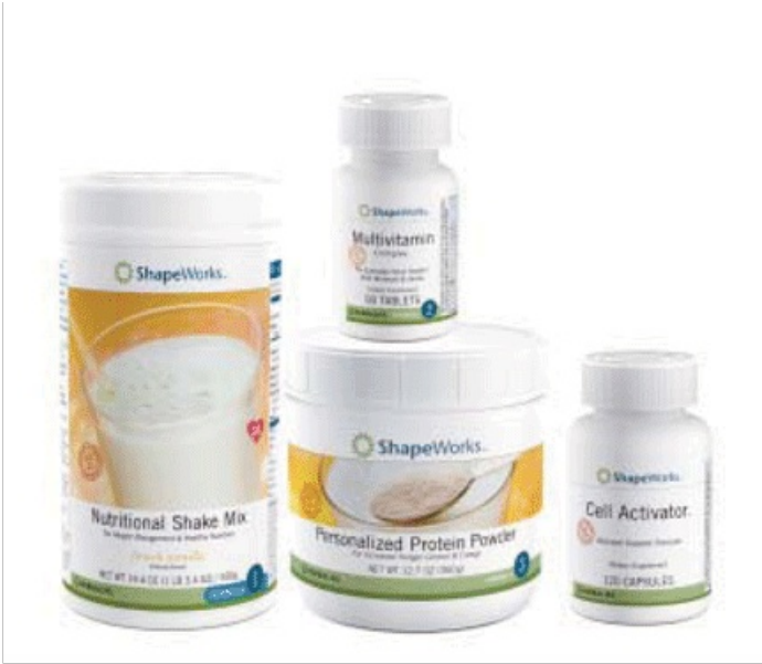
weight management good nutrition